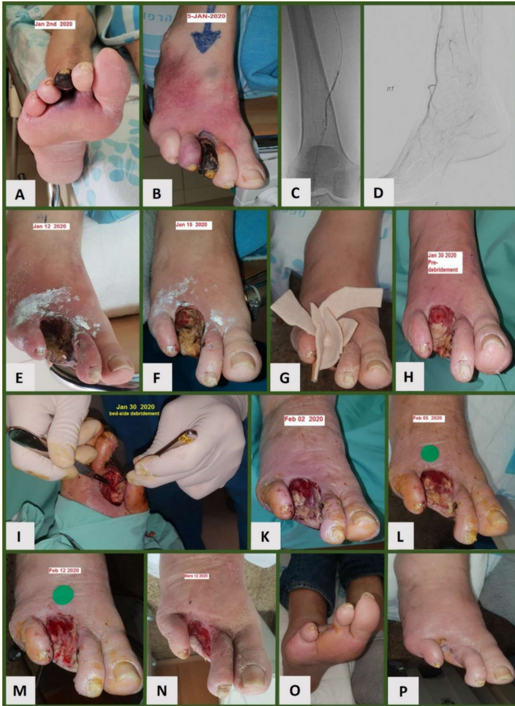
Figure 2. Healing of ray amputation in a diabetic vasculopathic patient on hemodialysis.