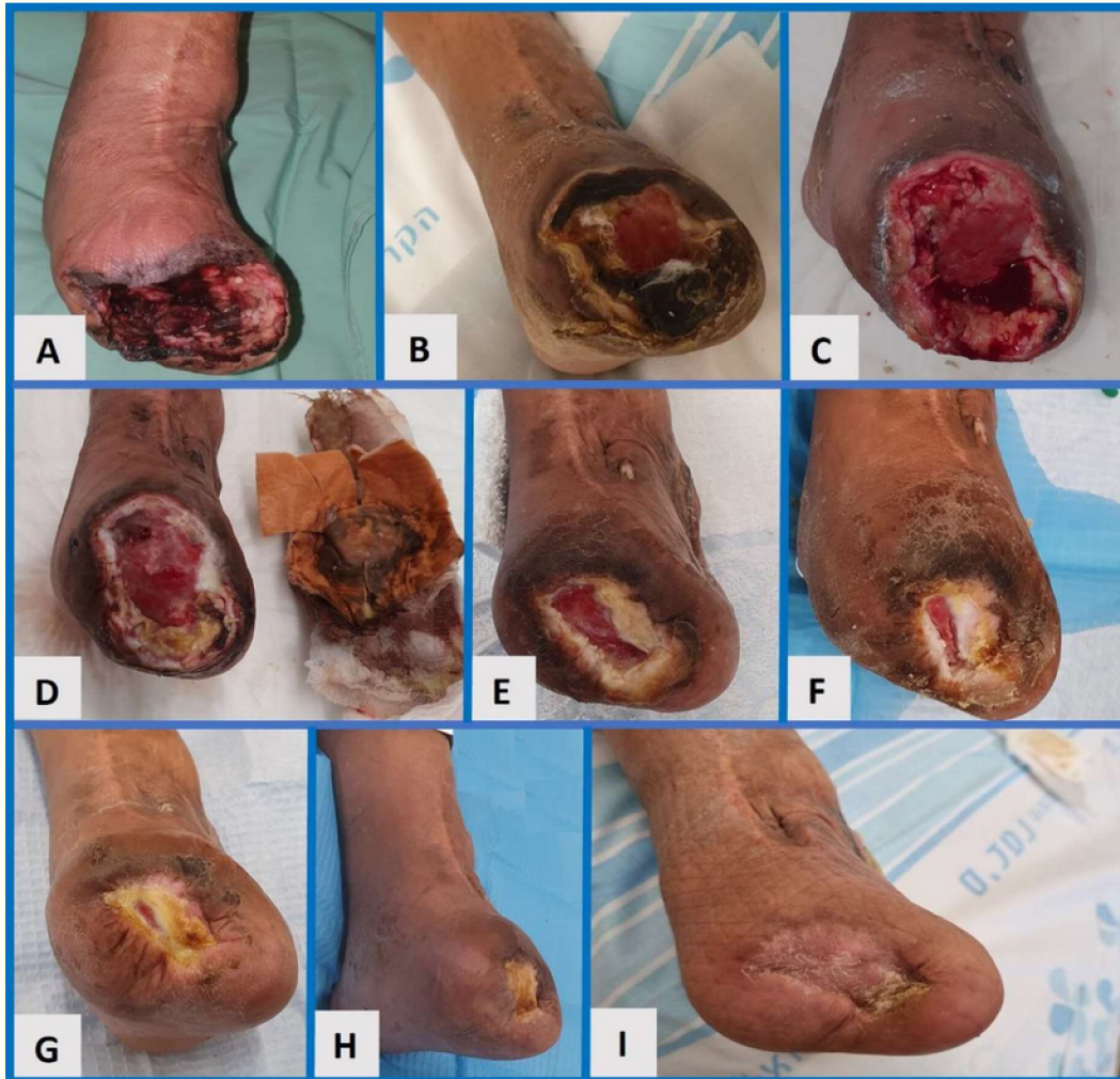
Figure 3: Healing and full closure of trans-metatarsal amputation stamp with large exposed bone.