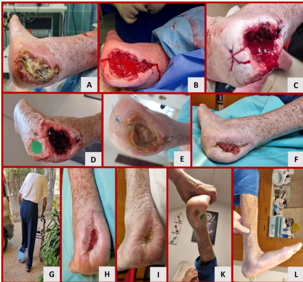
Figure 4: Healing of pressure injury after partial calcaneectomy.

While NPWT is the typical treatment for such cases, the decision was made to continue with the COD treatment. A bilayer copper dressing was packed into the wound and a larger COD dressing covered the heel and the nearby area. Gradually granulation tissue filled the wound and skin crawled from the sides. Once the wound was stable, a more convenient adhesive COD was applied. COD were applied 1-2 times a week; granulation tissue formed, and the wound gradually decreased in size while undergoing epithelialization (Figures 4D-G). Throughout this period, the patient was mobile (Figure 4H). At 3.5 months, the wound was successfully closed (Figure 4I). Antibiotic was prescribed for only 5 days post-surgery. In this case the COC approach is expressed by antibacterial activity, granulation tissue formation, and epithelization.