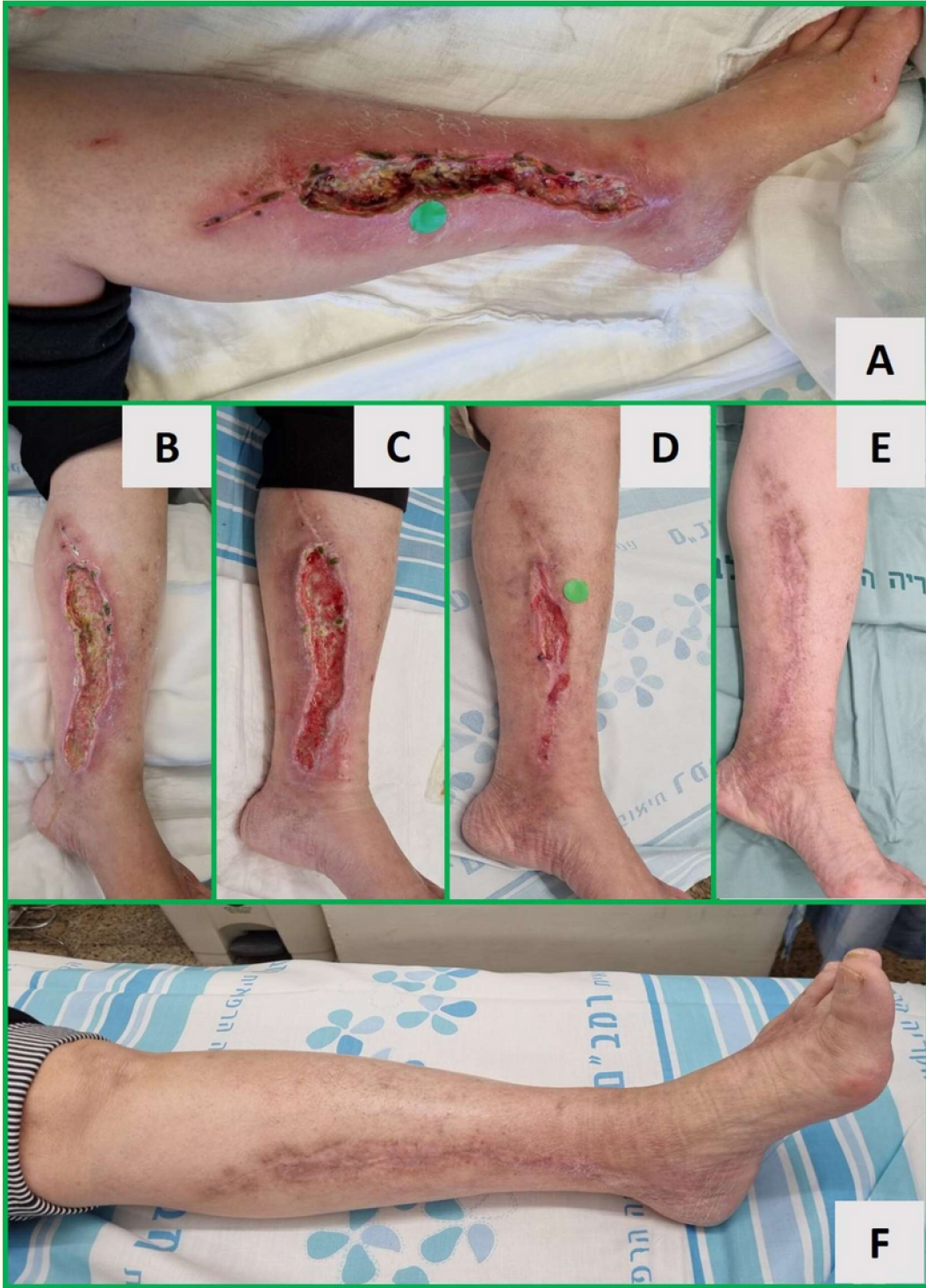
Figure 5: Healing of a venous harvesting site.