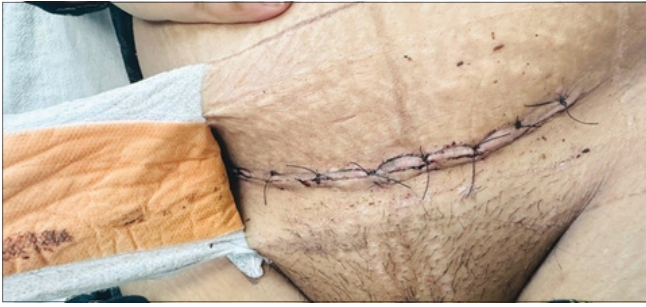
Figure 2: Copper-impregnated wound dressing removal on Day 7

needed resuturing. No adverse reactions or rejections were reported.